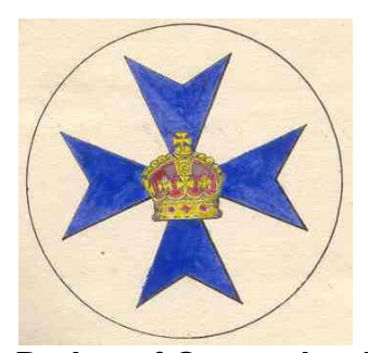
Badge of Queensland (Imperial Crown with raised arches)