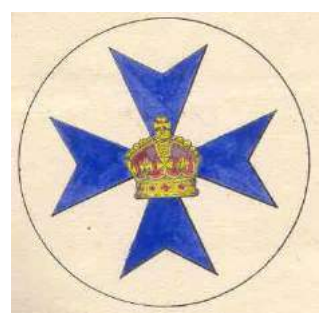
Badge of Queensland (Imperial Crown with raised arches)