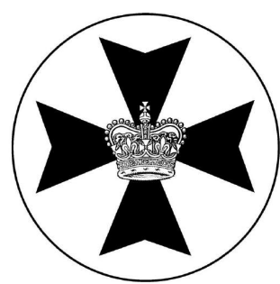
"Badge of the State" ("Royal Crown" with dipped arches)