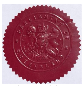
The Parliament of Queensland (Crown of the United Kingdom with the Lion and the Unicorn)