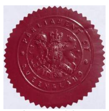
The Parliament of Queensland (Crown of the United Kingdom with the Lion and the Unicorn)